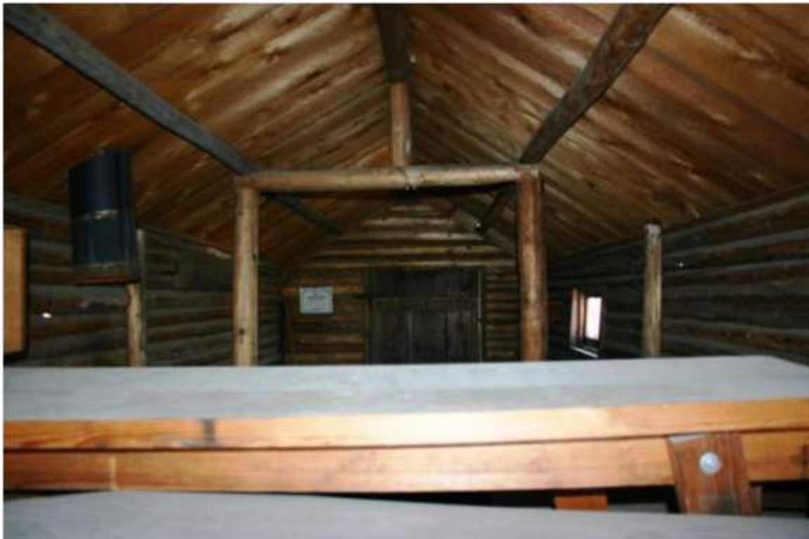
Inside view of the Blackjack Mining Cabin. You can see the handrails for the outside deck in the foreground.