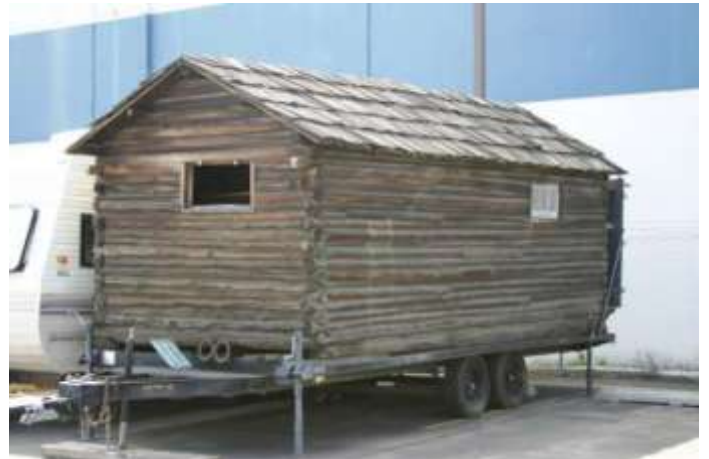
BLM Blackjack Mining Cabin

We are looking for a few things. We had a research request asking about the date that the Rustic Inn at Park Rapids burned. We have talked to everyone we think should know, but apparently not everyone because we still don't have the information. If you do – give us a call. Pictures or newspaper articles would be good.